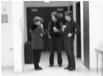
(who are these people and why is the picture so fuzzy???????)

WHAT IS UP WITH ALL THIS CONFIRMATION WORK ANYWAY?